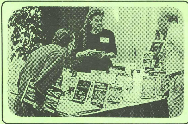
Above SAS Annual Meeting Book Display